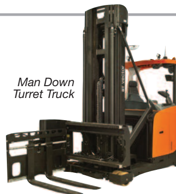
Man Down Turret Truck

Precision is key in all VNA operations. Rail, wire or radio guidance can assist with positioning, together with end of aisle control systems. Floor condition is critical for the safe operation of these trucks and specialist advice should be sought from appropriate truck manufacturers.